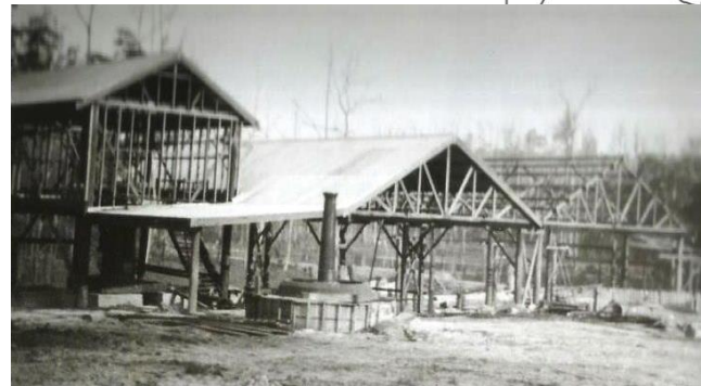
c1953: Brandon Sawmill