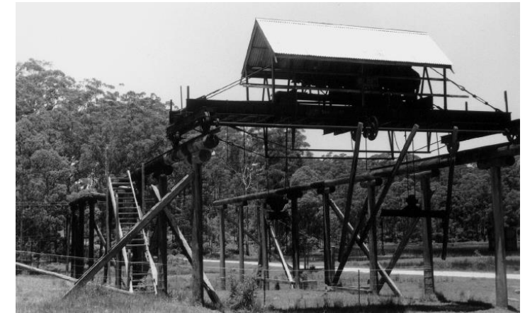
c1998: Brandon gantry

A substantial milling complex was established with a shed, gantry, houses for employed workers and a school building.