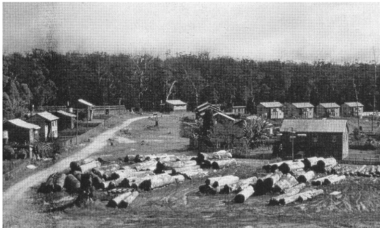
The settlement of West Bellthorpe around the mill.