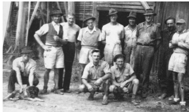
Workers at Brandon Sawmill