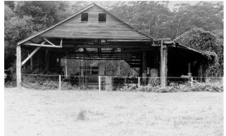
c1998: Brandon Sawmill

In about 1940, a large mill was built in the Bellthorpe area by Brandon, Lovf & Co Pty Ltd.