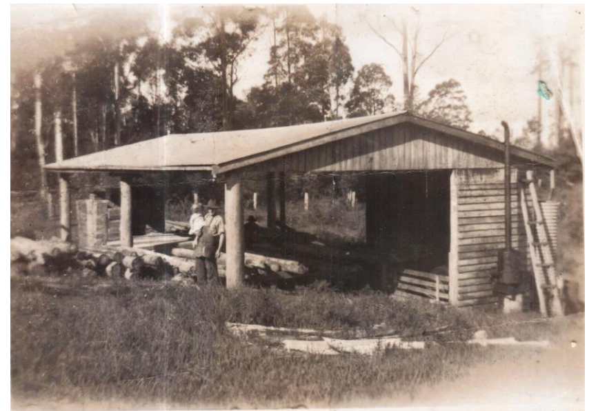
Osmond Bros Sawmill, Bellthorpe