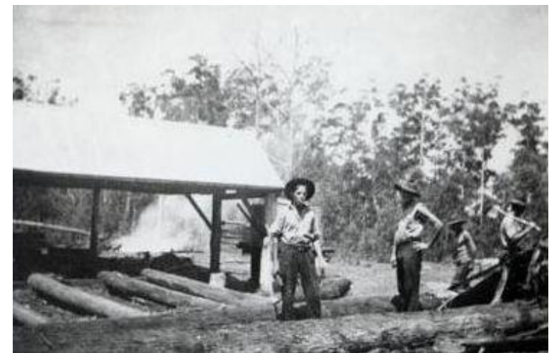
1950s: Svenson's Sawmill at Wamuran

Photo courtesy of City of Moreton Bay Ref No: CLPC – P0947