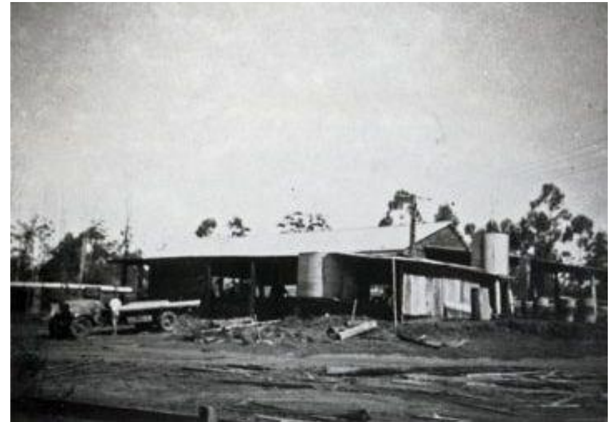
1950s: Svenson's Sawmill at Wamuran

By 1943 he set up a sawmill on the main road at Wamuran where the Wamuran School oval is today.