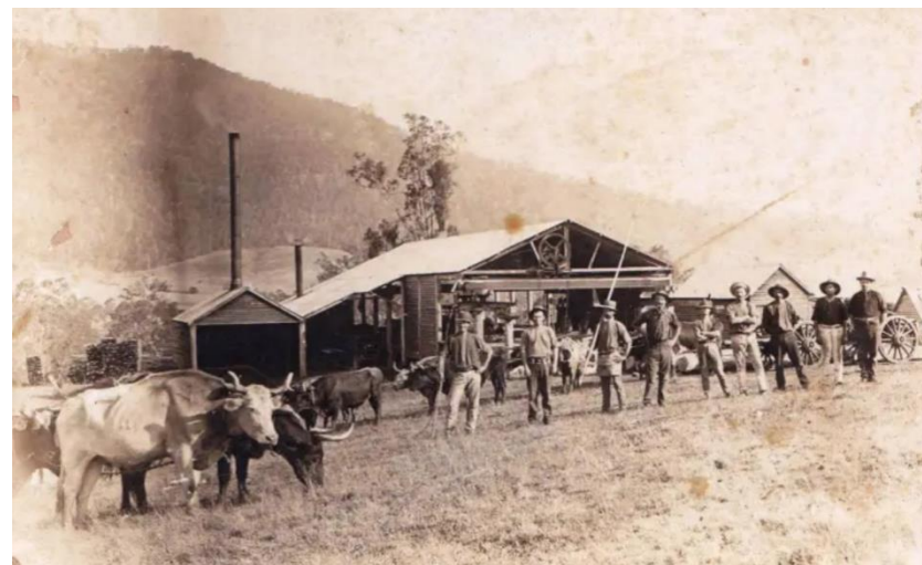
1913: Hancock's Sawmill, Villeneuve

The old-established and well-known arm of Hancock Brothers, of Ipswich and Brisbane, extended their operation by erecting a mill at Villeneuve in 1899.