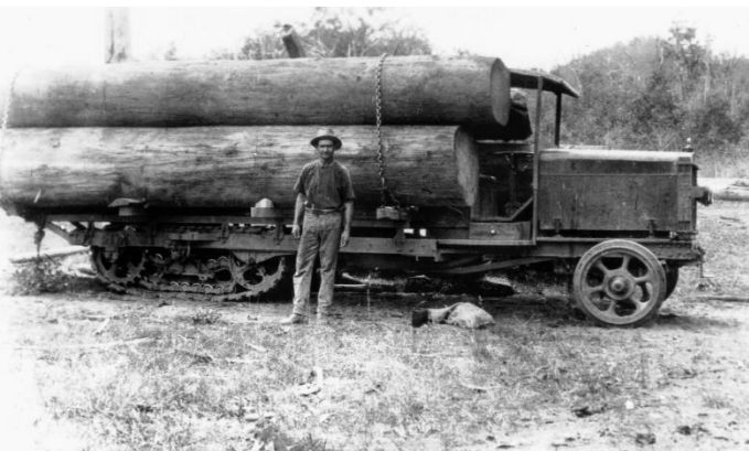
1929: Herb Curry with a Linn tractor truck loaded with hoop pine at Villeneuve.