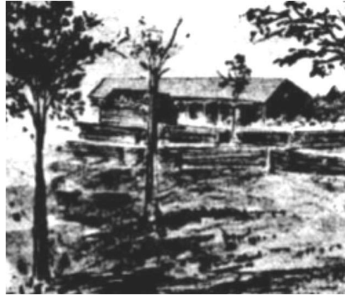
From TROVE: QUEENSLAND COUNTRY LIFE 1 July 1905