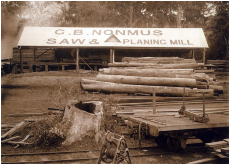
c1930: G B Nonmus Saw & Planing Mill, Lindsay Road, Buderim