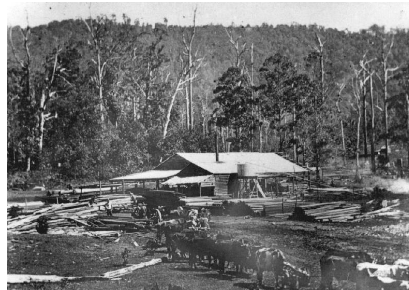
Nonmus Sawmill at Stanmore