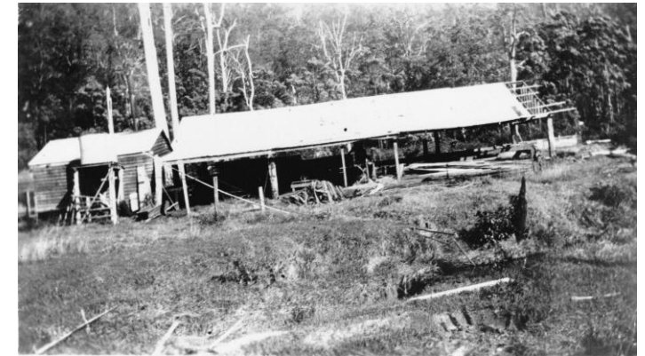
Nonmus Sawmill at Stanmore

From TROVE: NORTH COAST ADVERTISER 27 August 1920